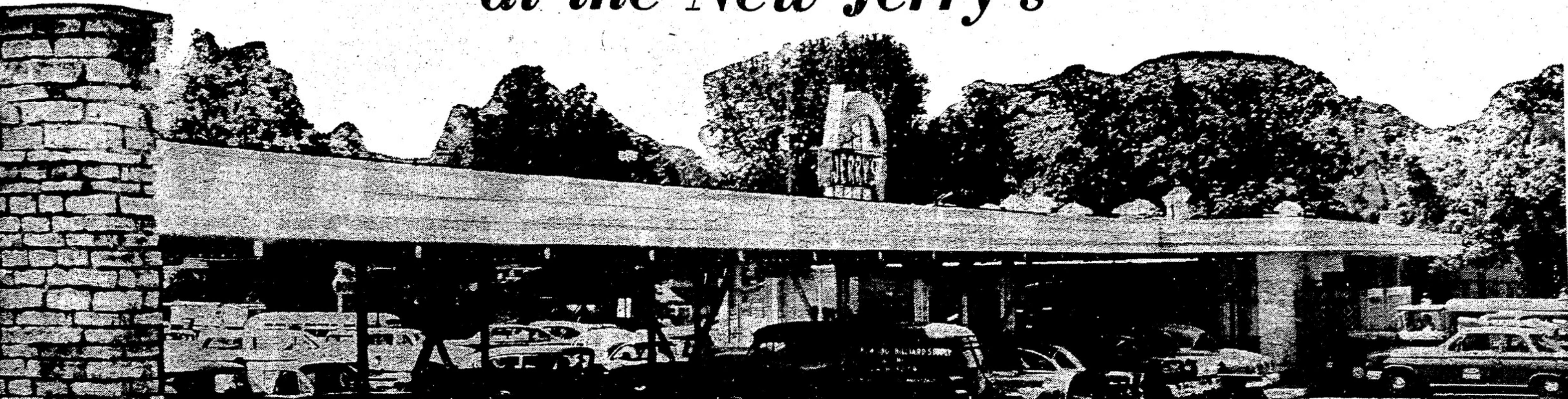
An extensive "service island" is as much a part of Jerry's as the delicious hamburgers and French fries.