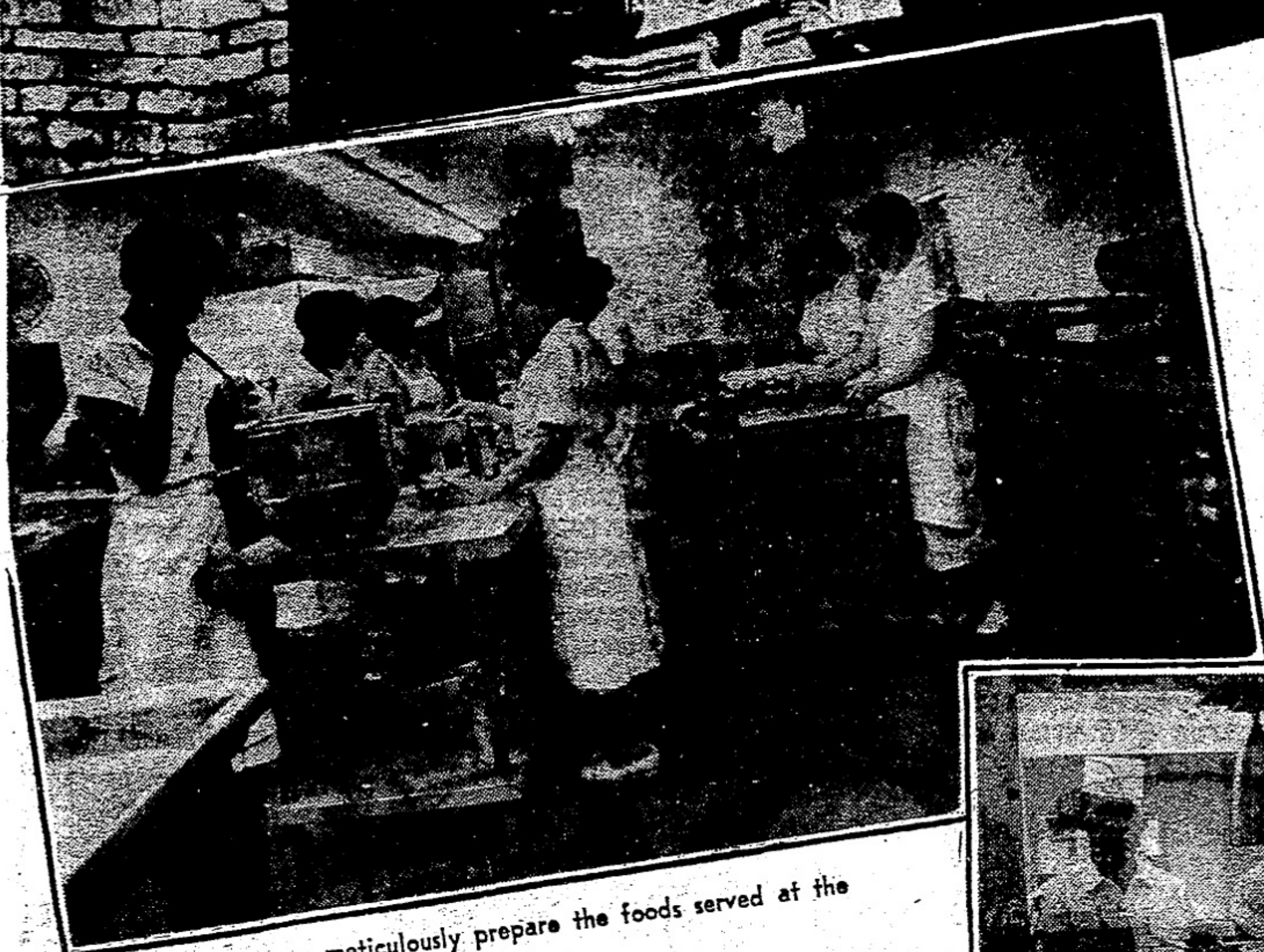
Neatly attired women meticulously prepare the foods served at the Drive-in—in a spotless kitchen.