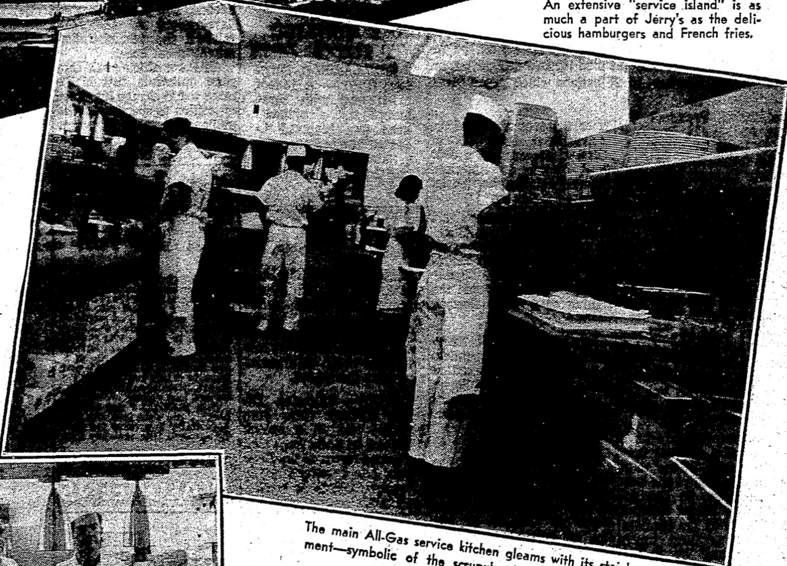
The main All-Gas service kitchen gleams with its stainless steel equipment—symbolic of the scrupulous care given in food preparation.