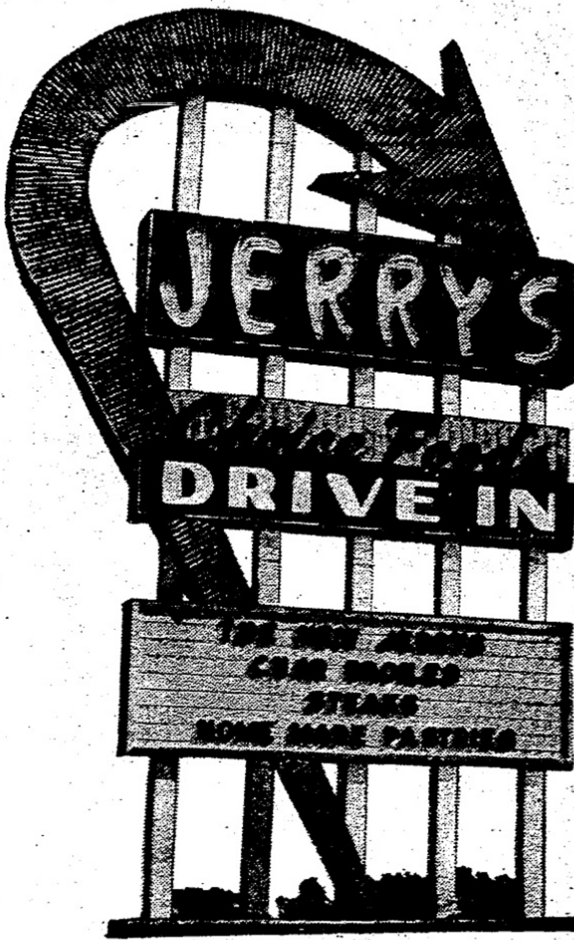
serve the thousands of patrons whose steady patronage has made it a famous name in Columbus and Central Ohio.